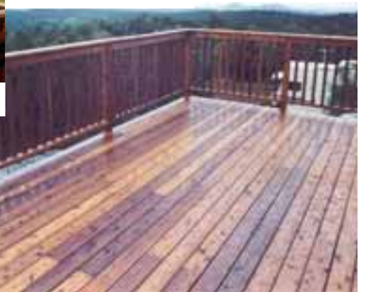
Knotty Cedar Decking