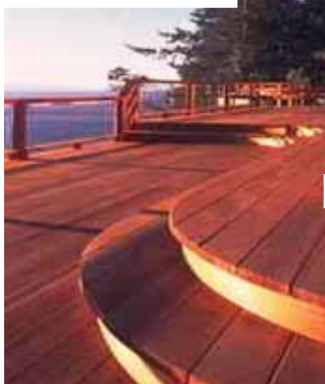
Clear Redwood Decking