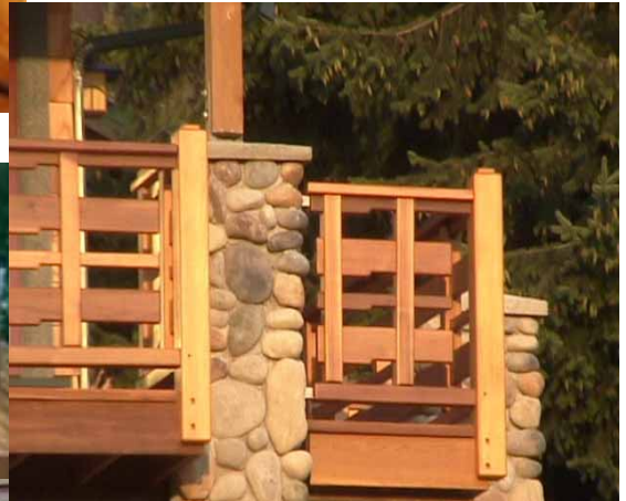
Clear Cedar Railings