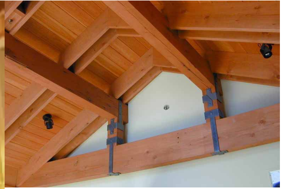
Clear Fir T&G, Beams