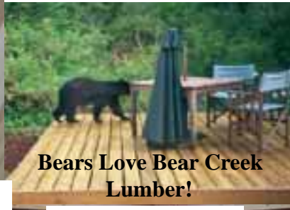
Bears Love Bear Creek Lumber!