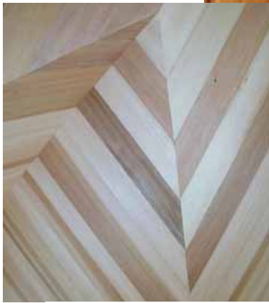
Knotty Pine T&G Paneling