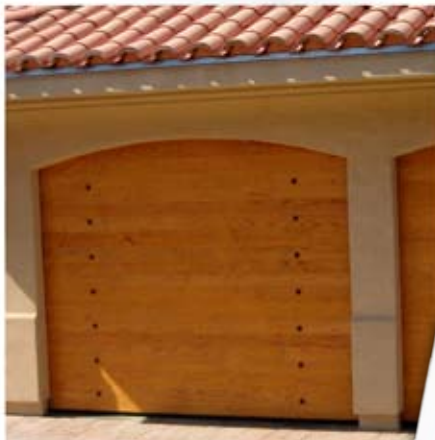
Port Orford Cedar garage doors Ventura, CA