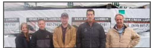
We strive to ship top quality lumber and to provide top service. Pictured above is the BCL Sales Team line-up.

Customer surveys and feedback forms are a great marketing tool for a small company like Bear Creek Lumber. Those of you who recently called have also found that our customer service representatives spend a few minutes getting information from new customers for our contacts database. Some people may find these questions intrusive, others may be afraid this information may be sold or shared with a third party. At Bear Creek Lumber all information taken from our customers is confidential. We have never, and will never, sell our data information to other companies. We firmly believe in our customers' right to privacy.