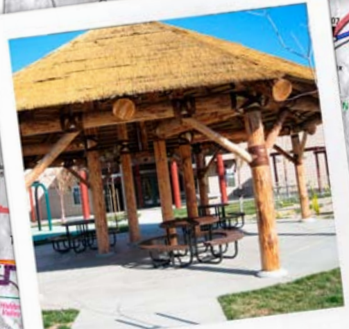
Douglas Fir peeled logs Tachi-Yokut Tribe Center Lemoore, CA