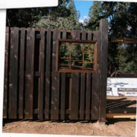
Alaskan Yellow Cedar fence Public Library Japanese Courtyard Pasadena, Ca