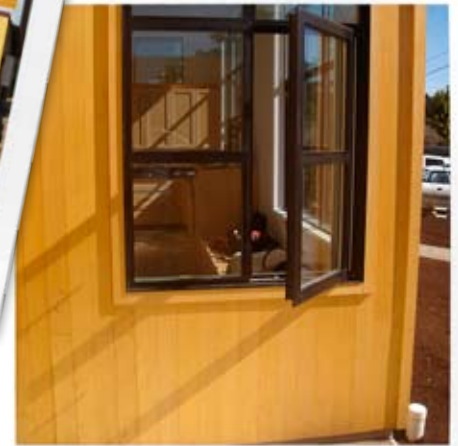
Alaskan Yellow Cedar 1"x3" siding San Francisco, CA