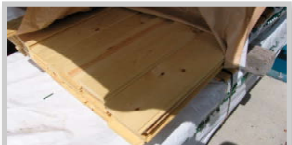
Ponderosa Pine Tongue and Groove Paneling - #2 Common Grade. 1"x6" $0.50 per linear foot.