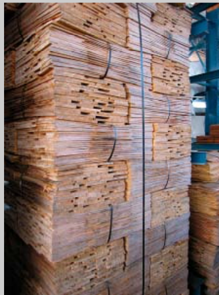
Alaskan Yellow Cedar 18" Shingles #3 and #4 Mill Grade - Starter and Sidewall courses - No less than 6" clear. $135 per square . Each square contains 4 bundles, and covers roughly 127 square feet at the recommended 7" exposure for sidewall application. These shingles cannot be used for roofing, please inquire about our #1 shakes and shingles for that application.