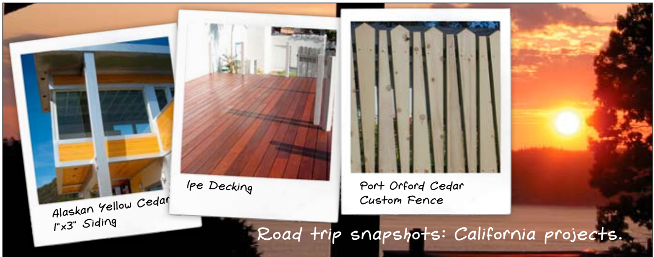
Road trip snapshots: California projects.

Customer Privacy rights Centerfold: California Road Trip and Specials To Stain or not to stain: Weathered Cedar exposed