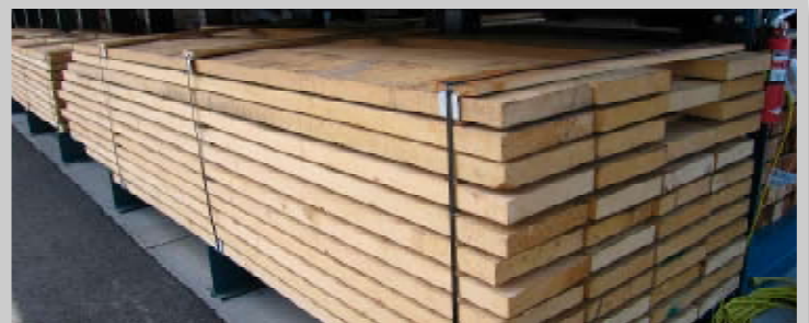
Alaskan Yellow Cedar Clear Grade. Rough cut. 2"x4" up to 2"x16" starting at $3.00 per board foot.