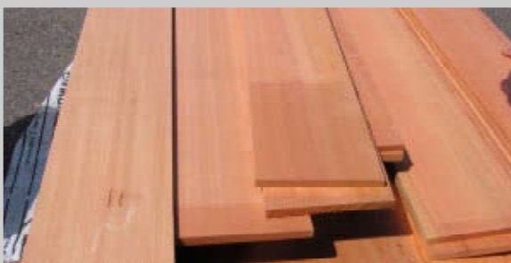
Douglas Fir Clear Vertical Grain - S4S - 1"x3" though 1"x12" Starting at $2.89 per board foot