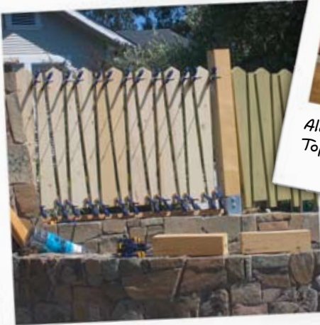
Port Orford Cedar fence San Rafael, Ca