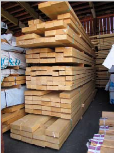
Port Orford Cedar Clear Grade - Rough Cut Surface 4"x 6" $ 9.80 per linear foot 4"x 8" $ 14.67 per lf 4"x10" $ 19.67 per lf 4"x12" $ 26.00 per lf