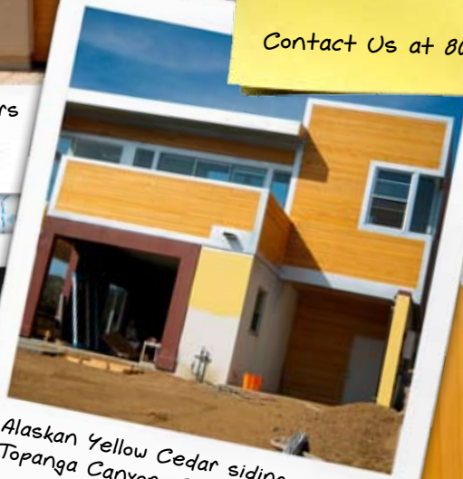
Alaskan Yellow Cedar siding Topanga Canyon, CA