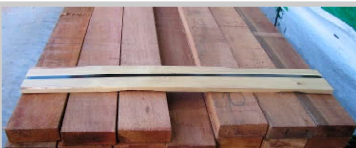
Western Red Cedar Clear Grade - Rough cut surface. Available in sizes up to 4"x12". Starting at $3.00 per board foot for 2"x4".